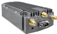
11.7×6.2×3.2cm/287g 2Watts×2/4Watts×2/5Watts×2 (7Z030/7Z035/7Z100) (Air to G. 20~100/100~150/100~200KM)