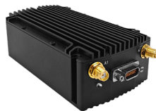
11.7×6.2×3.8cm/349g 11.7×6.2×4.2cm/360g 1Watts×2/2Watts×2 Extended WIFI/HDMI/SDI (Air to G. 20~50/50~100KM)