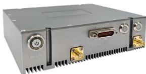
13.4×12.8×3.8cm/598g 14.2×13.7×5.7cm/1.08kg 10Watts×2/20Watts×2 (Air to G. 150~300/250~500KM)