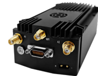
11.7×6.2×4.2cm/380g 2Watts×2/4Watts×2 Extended WIFI/HDMI/SDI (Air to G. 20~100/100~150KM)