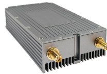
13.8×6.2×2.7cm/225g 13.8×6.2×3.1cm/271g 4Watts×2/5Watts×2 (Air to G. 100~150/100~200KM)