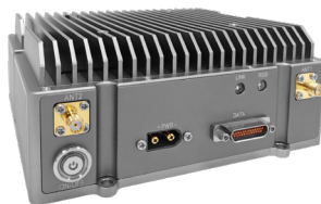
14.2×14.0×6.0cm/1.11kg 23.0×14.8×3.5cm/1.25kg 30Watts×2/40Watts×2 (Air to G. 250~500KM)