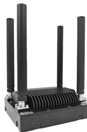
13.3×11.4×4.5cm/1.13kg 16.1×15.5×5.1cm/1.30kg 2W/4W, 10W/20W (Dual-band operation 2T2R, ULSC quad-band switching 1T2R) (Air to G. 20~150KM) (Air to G. 100~200KM)